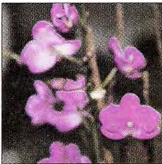
Beautiful flowers throughout from Quince Flowers